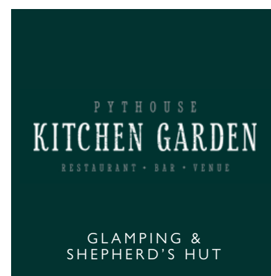
PYTHOUSE KITCHEN GARDEN WEST HATCH