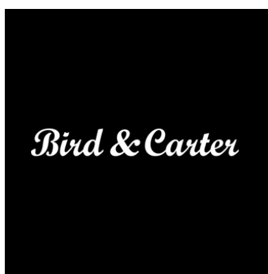
BIRD AND CARTER FONTHILL BISHOP

If you're thinking of staying in the area here is a list of places which could fit the bill, from glamping to b&bs and hotels. They come in no particular order and haven't been personally tested by us for sleepover reviews, but we have every reason to believe they make a jolly good starting point.