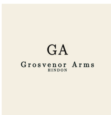
THE GROSVENOR ARMS HINDON