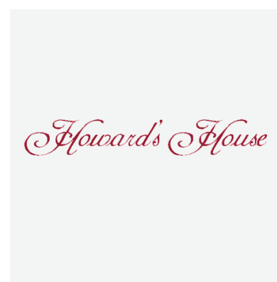
HOWARD'S HOUSE HOTEL TEFFONT EVIAS